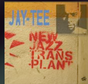
jay-tee - new jazz transplant